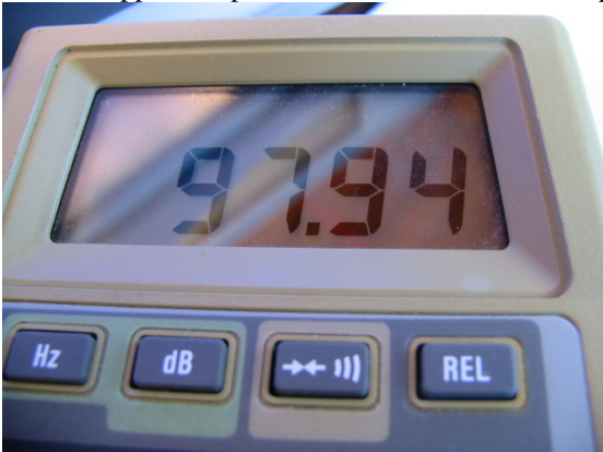
Current Measurement using Fluke 8060A Multimeter

Current Applied to pads was 97.94uA which was approximately 2% from the target of 100uA RMS.